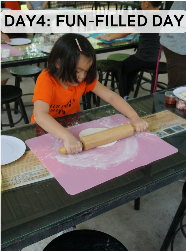
DAY4: FUN-FILLED DAY