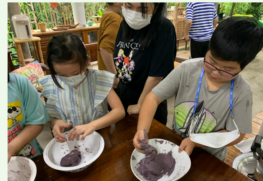
THAI COOKING CLASS